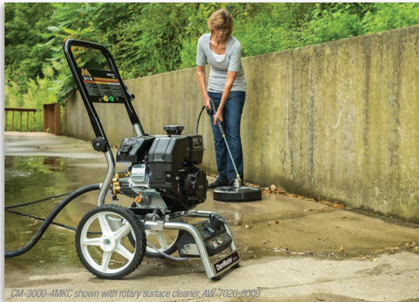
CM-3000-4MHC shown with rotary surface cleaner, AW-7020-8609

1 year Mi-T-M pump ♦ 1 year Kohler and Mi-T-M engines ♦ Honda engine: 3 month, commercial / 2 year, residential