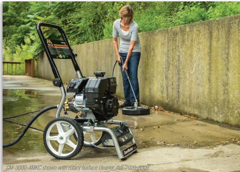
CM-3000-4MHC shown with rotary surface cleaner, AW-7020-8609

1 year Mi-T-M pump ♦ 1 year Kohler and Mi-T-M engines ♦ Honda engine: 3 month, commercial / 2 year, residential