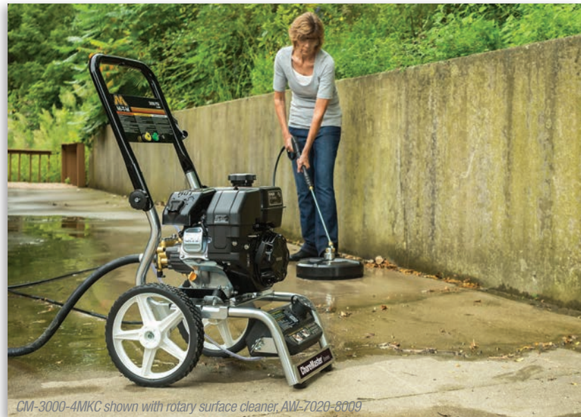
CM-3000-4MHC shown with rotary surface cleaner, AW-7020-8609

1 year Mi-T-M pump ♦ 1 year Kohler and Mi-T-M engines ♦ Honda engine: 3 month, commercial / 2 year, residential